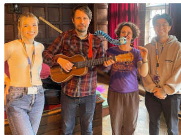
We loved singing along with the Travelled Companions.