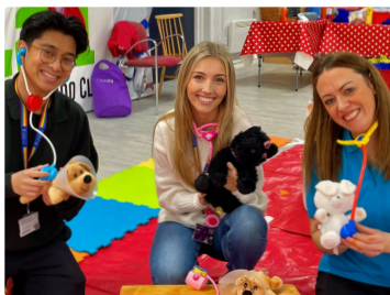
Animal fun at the Creation Station in Crosby.