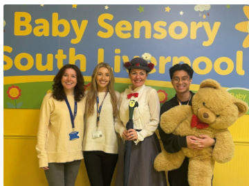
Enjoying World Book Day at Baby Sensory in South Liverpool.

We spoke to families about the work we do at the Language Lab and had lots of little scientists signing up to get involved with our studies. If you are a child-friendly group and would like to work with us in the future then please get in touch!