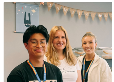
Celebrating all things America at Babble Bunnies in Hoylake.